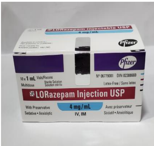
Figure 1. Lorazepam injection USP 4mg/ml multidose glass vials, outer packaging

To help mitigate the shortage, Pfizer have sourced lorazepam injection 4mg/ml glass vials from Canada, which are considered unlicensed in the UK.